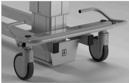
Convenient single foot control for straight steering and brakes.

The trolley is made of durable material, powder coated steel, zinc plated steel that make cleaning simple and efficient. The mattress is easily removable.