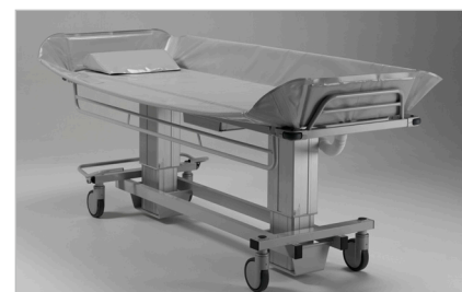
Side rails swing down or lock in horizontal position for transfer and up position for safe transport.

The side rails keep the person safely in place. Side rails swing down for transfer and lock into up position for person security and a secure transport. The trolley has central foot operated castor brakes and straight steering. The stretcher has two positions, flat for transfer and tilt for transport, shower and improved drainage. TR 4200 is delivered with mattress, high capacity rechargeable batteries, hand control, drain plug and hose.