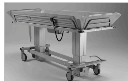
Tilting for "Trendelenburg" position and easy drainage.